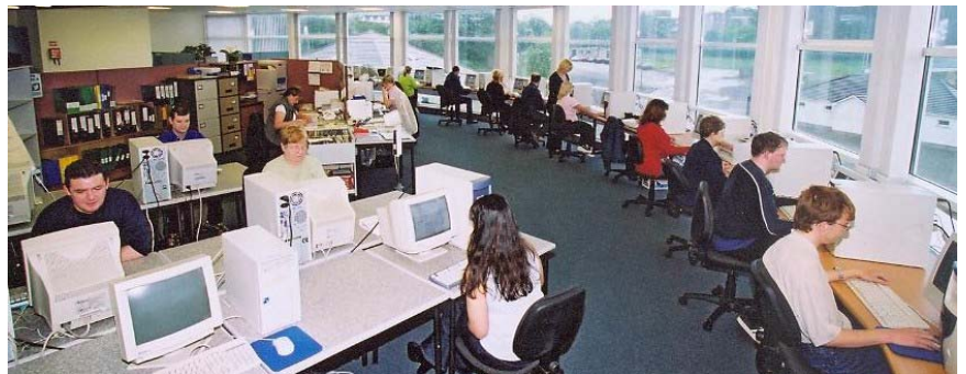
Students at work in the O'Leary New Hope Centre

The Ireland Institute has hosted over 1,500 young people from Ireland and Northern Ireland throughout its 16-year history. Many of these young leaders are participants in the International Fund for Ireland Wider Horizons Program or the Irish Peace Process Cultural and Training Program. They have gone home as leaders in peace and reconciliation, with the skills and ideas necessary to foster economic development at home.