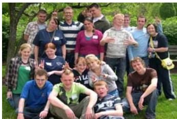
Monaghan and Portadown Partnership

This year the Institute welcomed three Wider Horizons groups. In May our first group, from the Monaghan and Portadown Partnership arrived for an eight-week stay. Their program known as "Options" gives the participants the choice of what type of internship experience they would like. This group's interests were quite varied and placements ranged from YMCA facilities, to law firms, real estate companies and radio stations. Information Technology was the focus of this groups training at Duquesne and all enjoyed a trip to Washington DC among other activities during their stay.